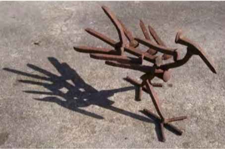
A sculpture of a roadrunner that was repaired by the Welding Lab.

These include: balance, clarity, gratitude, teamwork, service, and trust." He continued his address with these uplifting words, "Our goal is to be our genuine selves, to encourage gratitude for the strengths of each other, and to allow our gifts to have immediate power in the world we experience today while shaping in others the ability to live in a purposeful, grounded manner that